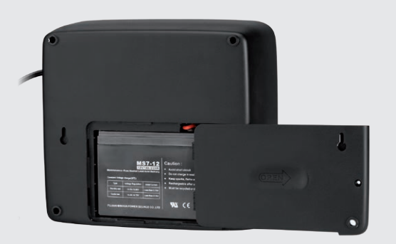
Easy replacing of the battery included in the case