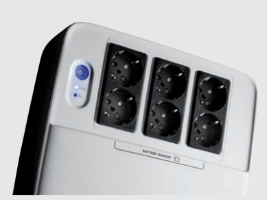
Indication and signaling user-friendly